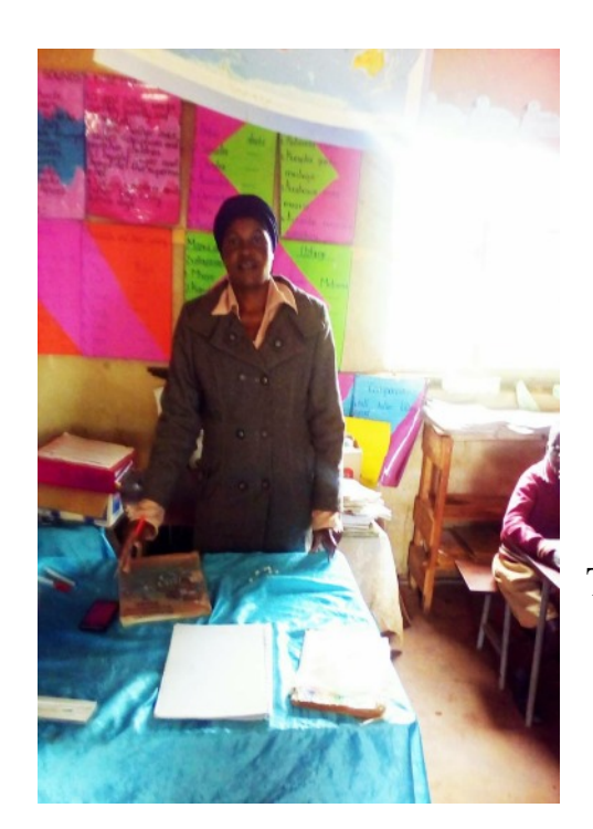
School competition winners